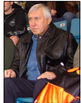
Grey Cup at BC Place November 2005

The following was written and read by Jeff Knoblauch for Derek Randall's memorial service held on January 23rd